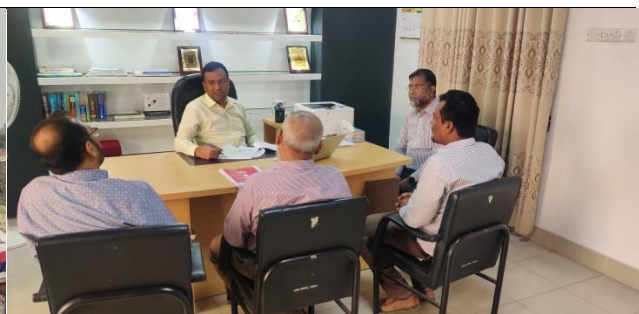
Photo 22: Meeting with the ADC about expediting the land acquisition of Polder-41/1& 40/2.