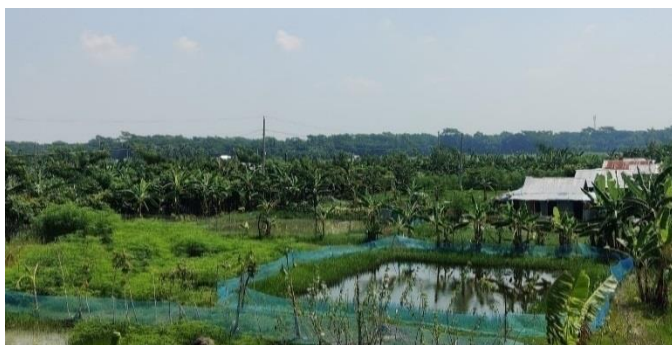
Photo 36: Group relocation site of Dhakin Charduani of Polder 40/2