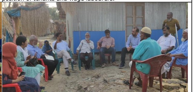
Photo 26: In presence of the WB team, meeting with awardees of Polder-48 near DS-2 on 30.05.2023.