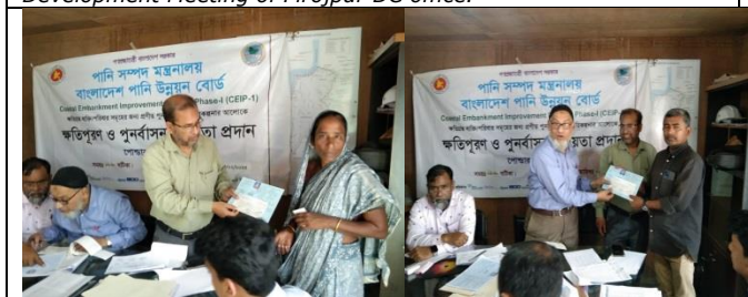
Photo 27: Compensation & Resettlement Assistance provided to squatter in Polder-39/2C through BWDB.