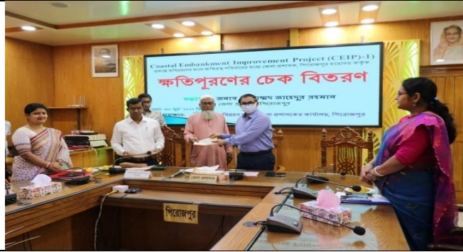
Photo 1: DC, Pirojpur distributed cheque to awardees of Polder-39/2C.