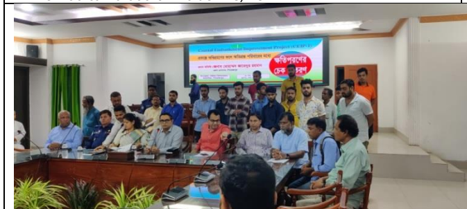
Photo 23: Mr. DC, Pirojpur distributed cheque to awardees of Polder-39/2C on 15.03.2023.