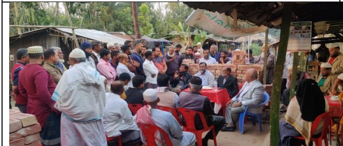
Photo 13: Meeting with UNO, Bhandaria of Pirojpir District at Monju bazar regarding alignment issues of Polder-39/2C