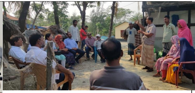
Photo 12: In presence of the WB team, meeting with awardees of Polder-48 near DS-6 on 30.05.2023.