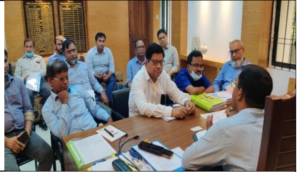
Photo 2: Meeting with ADC & LAO, Pirojpur in presence of PD, CEIP-1 regarding to expedite the CUL payment of P_39/2C.