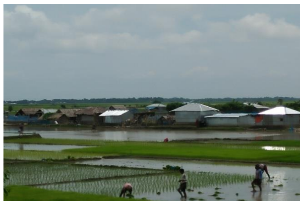
Photo 30: Group Relocation site: Chunkuri (Dangapara) CEIP-1 Resettlement Village under Polder-33