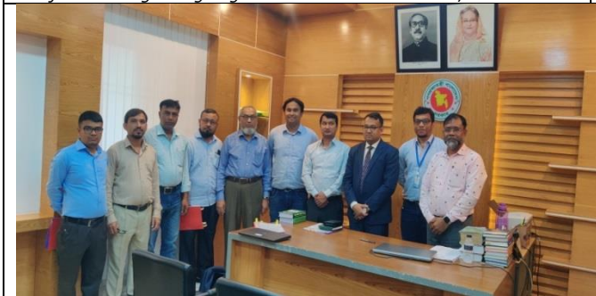
Photo 15: Meeting with ADC, Pirojpur regarding to expedite the CUL payment of Polder-39/2C.