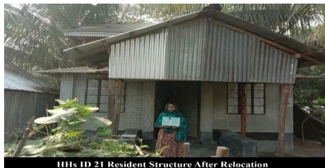
HHs ID 21 Resident Structure After Relocation