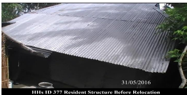
HHs ID 377 Resident Structure Before Relocation