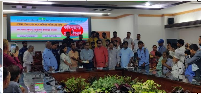
Photo 20: Mr. DC, Pirojpur distributed cheque to awardees of Polder-39/2C on 15.03.2023.