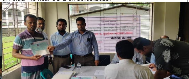
Photo 28: Compensation & Resettlement Assistance provided to Tenants & wage labour in Polder-47/2 & 48 through BWDB.