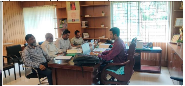
Photo 18: LA Committee meeting was held at Patuakhali XEN office to identify & solve the problem of LA of Polder-43/2C.