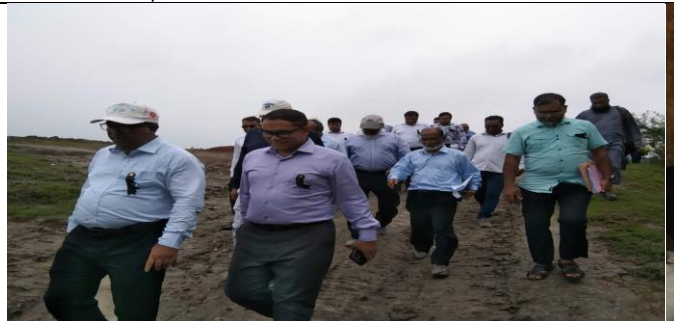
Photo 9: Honorable Secretary of MoWR & DC, Pirojpur inspected the work of Polder-39/2C under CEIP-1 in presence of PD, XEN's TL, DTL & other officials.