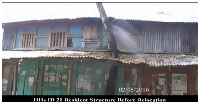
HHs ID 21 Resident Structure Before Relocation