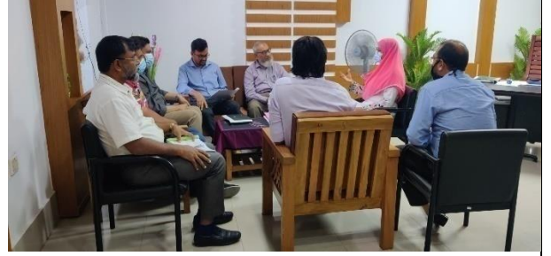
Photo 6: Meeting with ADC, Khulna in presence of WB & PMU officials regarding expedite the CUL payment of P_32 & 33.