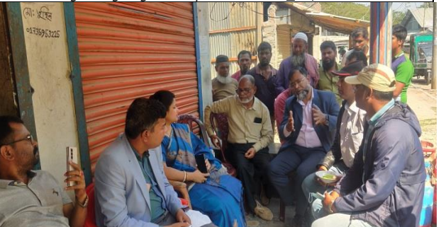
Photo 10: Meeting with UNO, Bhandaria of Pirojpur District at Monju bazar regarding alignment issues of Polder-39/2C