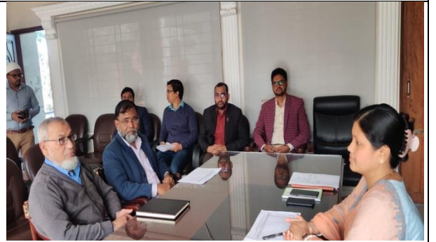
Photo 8: Meeting with UNO, Bhandaria Upazila under Pirojpur district regarding alignment problems of P_39/2C.