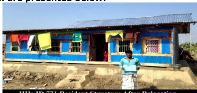
HHs ID 771 Resident Structure After Relocation