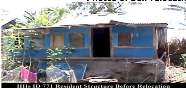
HHs ID 771 Resident Structure Before Relocation