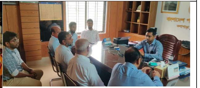
Photo 14: Meeting with XEN, BWDB Kalapara regarding payment to tenant & wage labour of P-47/1 & 48.