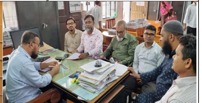
Photo 16: Meeting with LA branch of Pirojpur regarding to expedite the CUL payment of Polder-39/2C.