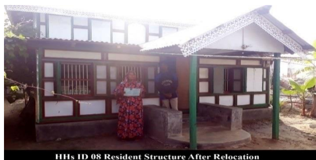
HHs ID 08 Resident Structure After Relocation