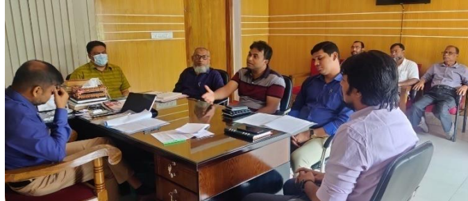
Photo 5: Meeting with ADC & LAO, Jhalakathi in presence of WB Team & PMU officials regarding to expedite the CUL payment of Polder-39/2C (Jhalakathi District).