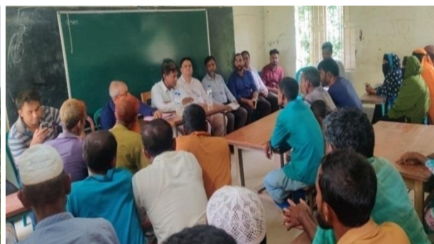
Photo 37: Meeting with relocated EPs at Dakhin Charduani of P-40/2.