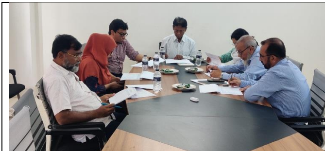
Photo 11: Meeting with Social Team of the World Bank (WB) Mission at CEIP-1 conference room, Patuakhali on 30.05.2023.