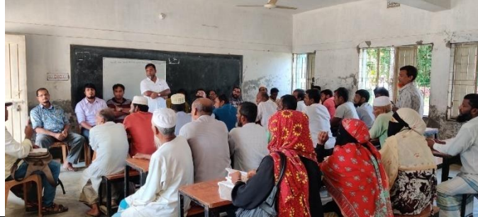
Photo 3: Meeting with awardees at Choto-Shewla mouza of Polder-39/2C for submission of application to get CUL payment.