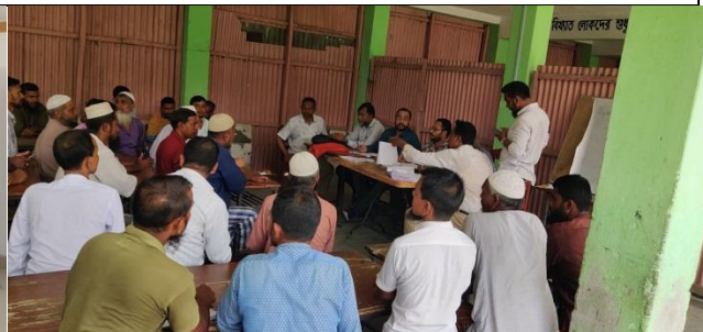
Photo 24: Meeting in Polder-43/2C by the committee for finalizing the list for spot verification considering the present position of tenants and wage labourers.