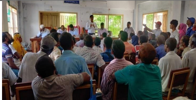
Photo 7: Consultation Meeting with titled landowner at Suterkhali UP of Polder-32 in presence of DC officials.