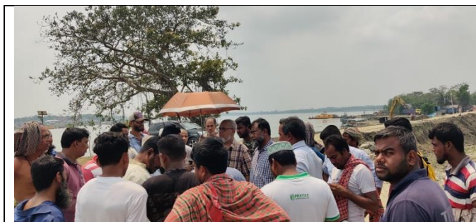
Photo 21: The LA committee created a working environment by meeting with those who had problems to embankment work from km 19.100 to 20.000 of Polder-43/2C.