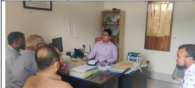
Photo 19: The LA Committee is requests the LAO of Pirojpur to expedite the payments for the acquired land of Polder-39/2C.