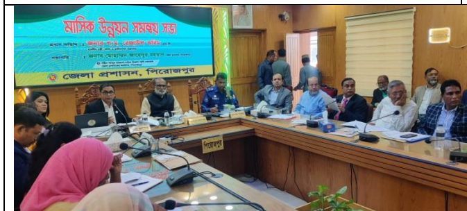
Photo 25: Presence of representative of CEIP-1 project in Monthly Development Meeting of Pirojpur DC office.