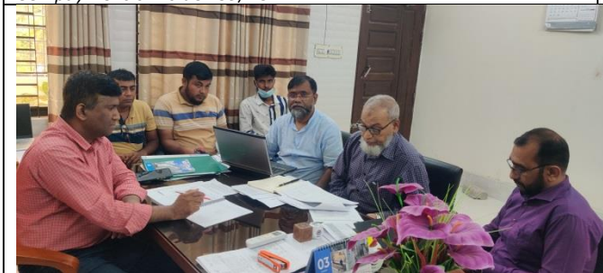
Photo 17: LA Committee meeting was held at Pirojpur XEN office to identify & solve the problem of LA of Polder-39/2C.