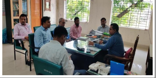
Photo 4: Meeting with ADC, Patuakhali regarding LA issues and payment of CUL of Polder-43/2C, 47/2 & 48.