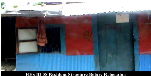
HHs ID 08 Resident Structure Before Relocation