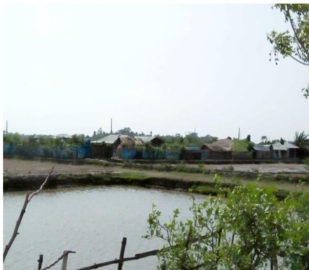
Photo 29: Group Relocation site: Meeting at CEIP Village, Uttar Kamarkhola under Polder-32